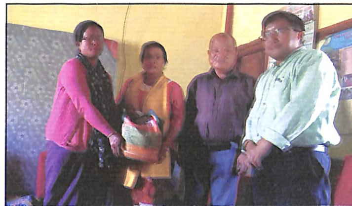
Distribution of Hybrid maize seeds to the SHG members