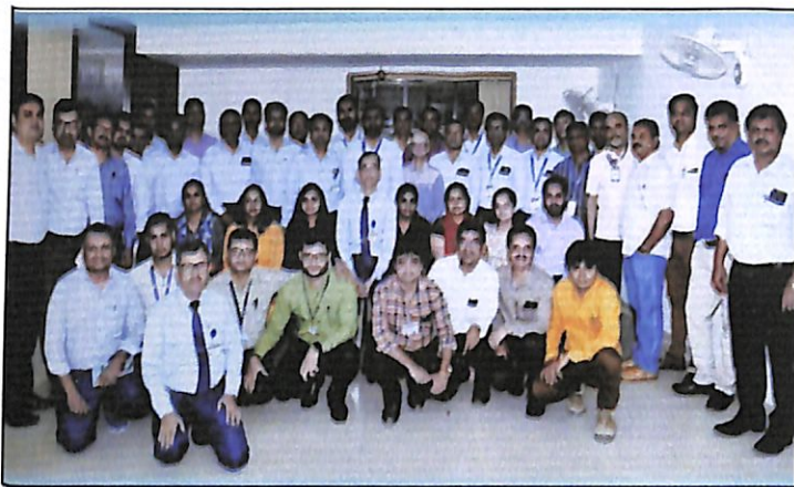
A group photo of the participants of the workshop

RICM Gandhinagar organised one day workshop on Credit Information and Compilation of data with Credit Information Companies for Urban Cooperative Banks and District Central Cooperative Banks of South Gujarat on 28 January, 2020 in Surat. This workshop was organised in collaboration with CRIF High Mark Credit Information Pvt Ltd, Mumbai. 50 Cooperative Banks took participation in workshop.