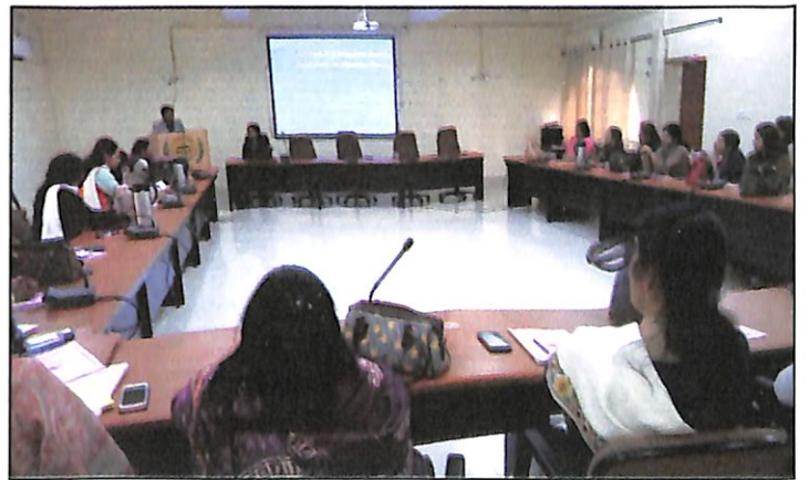
कार्यशाला के दौरान महिला प्रतिभागियों का एक दृश्य

सहकारी प्रबंध संस्थान जयपुर में दिनांक 13 फरवरी 2020 को "श्रीमती सरोजनी नायडू जन्मदिवस (राष्ट्रीय महिला दिवस)" पर कार्यशाला आयोजित की गई, जिसमें सहकारी विभाग, राजस्थान, जयपुर की 56 महिला अधिकारियों, निरीक्षकों एवं कर्मचारियों ने भाग लिया।