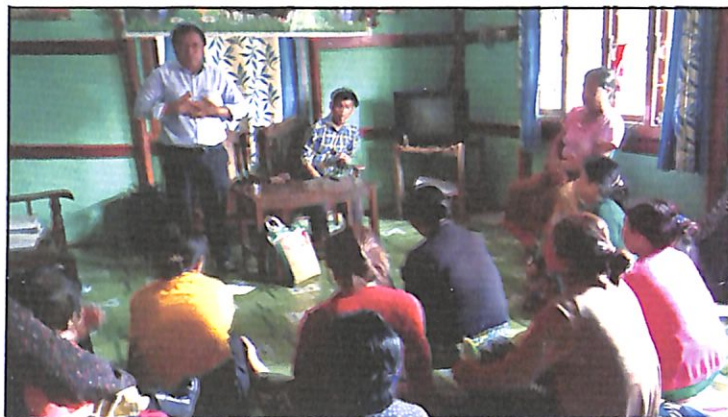
A view of participants during training session

ICM, Imphal conducted two days outstation Training Programme on Sensitisation of SHGs for Income Generating Activities specially for ST at AimolKhullen Village, Tengnoupal District, Manipur w.e.f. 11-03-2020 to 12-03-2020. Altogether 28 women participated in the training programme. Hybrid maize seeds were distributed to the SHG members during the programme.