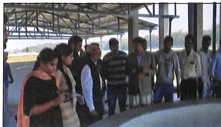
A view of the participants during the field visit of the programme