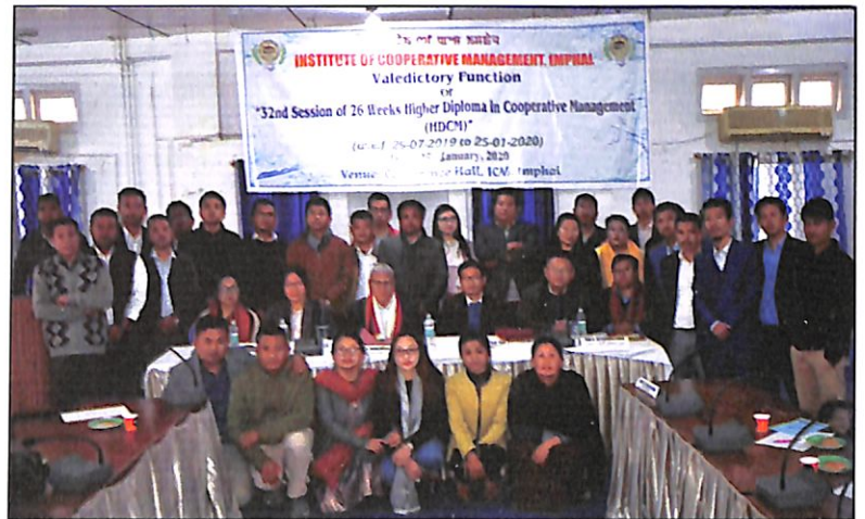
A Group Photo of the Trainee Officers along with Chief Guest, President, Guest of Honour & Director(i/c), ICM, Imphal