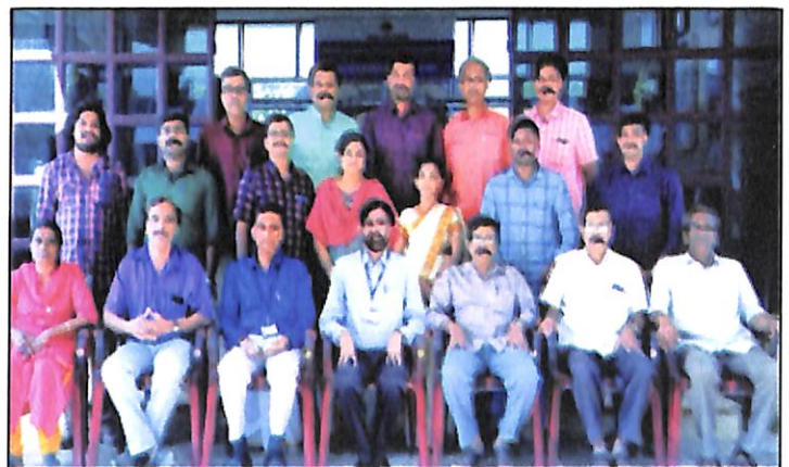
A group photo of the participants of programme on Core Banking and Cloud Computing Solutions.

Also organized programme on Core Banking and Cloud Computing Solutions for the Presidents/Secretaries/Senior Officers of SCBs on 30-31 January, 2020. 17 participants attended the programme.