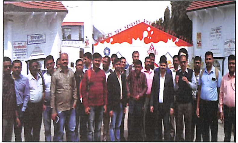
A view of the participants in Shudh Milk Plant at Barabanki during field visit.

The Institute organized a three-month Certificate Course in Retail Management in collaboration with Director General Resettlement under Ministry of Defence, Government of India from 06.01.2020 for the Defence personnel. The objective of the programme is to train the retiring defence personnel for taking up retail business as career. Altogether 35 participants participated in the programme.