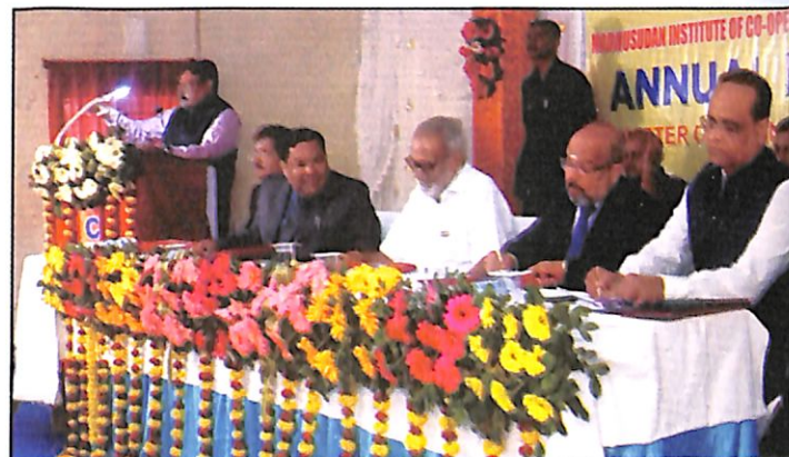
A view of the dais during the Inaugural ceremony of the Annual Day Function