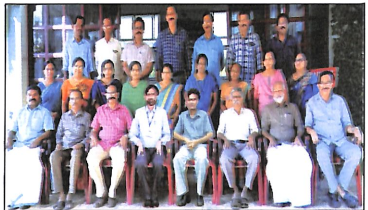
A group photo of the participants of the programme on Digital Banking and Cashless Transaction