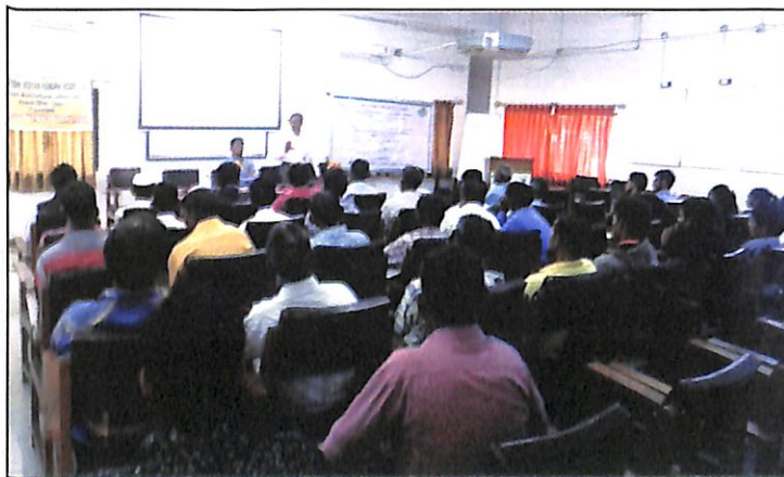
A view of the District Level Awareness Programme for ISAM-AMI Scheme

RICM Gandhinagar organized District Level Awareness Programme for ISAM – AMI scheme to create awareness among farmers about AMI scheme of Govt of India. The awareness programme was held on 21.1.2020 at Dang and was attended by 50 farmers. The programme was organised in collaboration with CCS National Institute of Agriculture Marketing, Jaipur.