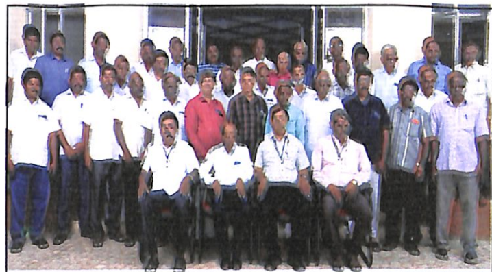
Participants of the programme on Capacity Building for the In-Charge Managers/Supervisors/Representatives of Warehouses Registered with WDRA in Salem District of Tamil Nadu.

ICM, Madurai in collaboration with Warehousing Development Regulatory Authority (WDRA), New Delhi organized 5 days Capacity Building Training Programme for In-charge Managers / Supervisors/ Representatives of the Warehouses Registered with WDRA in Salem District in Tamil Nadu from 16th March, 2020 to 20th March, 2020. The objective of the programme was to enable the participants to enhance their skill in warehouse management. Altogether 36 participants participated in the programme.