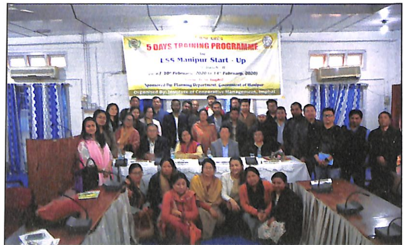
A Group Photo during Valedictory Function

The Institute conducted ESS Manipur Start-Up Training Programme (Round II, Batch - II) from 10th February, 2020 to 14th February 2020 under the sponsorship of Planning Department, Government of Manipur. Altogether 42 trainees participated in the programme.