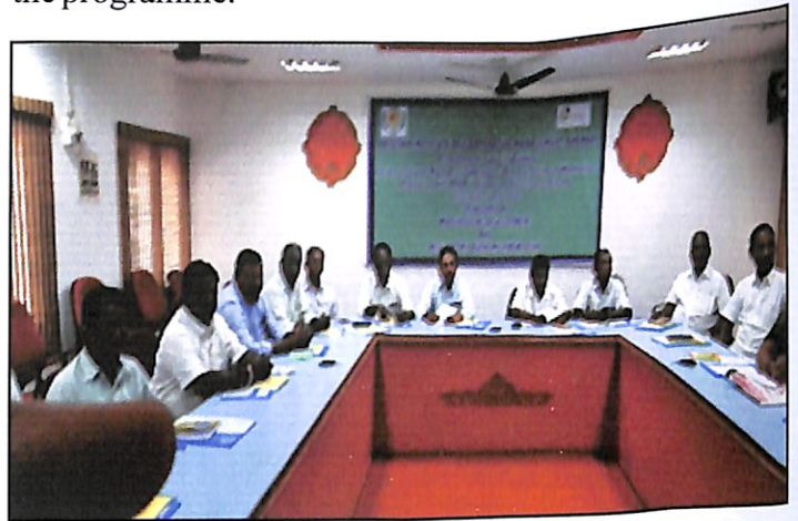
Participants of the programme on Capacity Building for the In-Charge Managers/Supervisors/PACS Secretaries & Asst. Secretaries of Warehouses Registered with WDRA in Villupuram District of Tamil Nadu.

ICM, Chennai in collaboration with Warehousing Development Regulatory Authority (WDRA), New Delhi organized 5 days Capacity Building Training Programme for In-charge Managers/Supervisors/ Representatives of the Warehouses Registered with WDRA in Villupuram District in Tamil Nadu from 16th March, 2020 to 20th March, 2020. The objective of the programme was to enable the participants to enhance their skill in warehouse management. Altogether 36 participants participated in the programme.