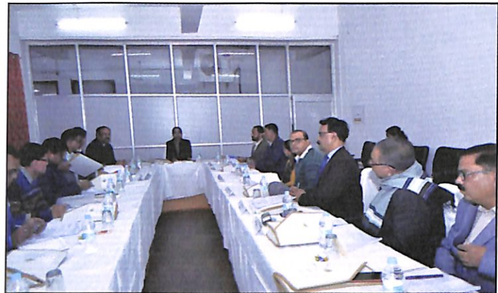
A view of the Programme Advisory Committee Meeting