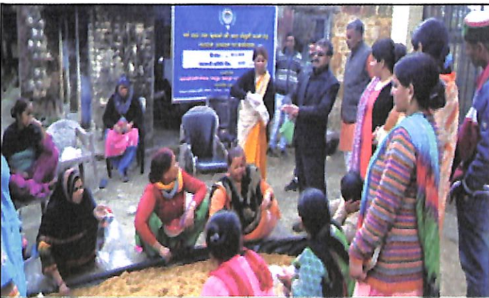
जागरूकता प्रशिक्षण कार्यक्रम का एक दृश्य

सहकारी विभाग के अधिकारियों एवं कार्मिकों हेतु स्वस्थ जीवन शैली पर एक दिवसीय सेमीनार सहकारी प्रबंध संस्थान, जयपुर