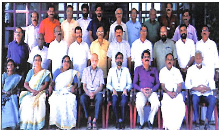
A Group Photo of the Board of Directors of UCBs along with Director I/c, ICM, Kannur and Dy. Director, ICM,

The Institute organized the Leadership Development Programme for the Board of Directors of Urban Cooperative Banks in Kerala from 20th January, 2020 to 22nd January, 2020. 25 participants attended the training programme.