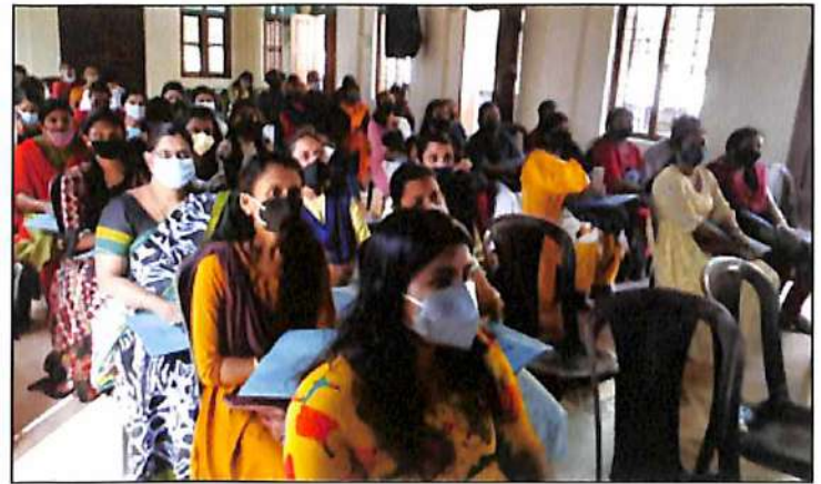
A view of the Gold Appraisal Programme conducted at Thrissur Circle Cooperative Union, Chavakkad