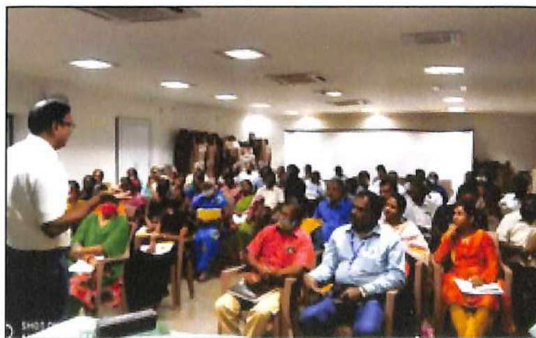
A view of the Programme on Funds Management and Business Development of PACCS, Coimbatore District