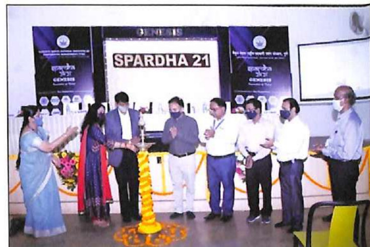
A view of Annual Student B—fest “SPARDHA 2021” at VAMNICOM held on 6th March, 2021