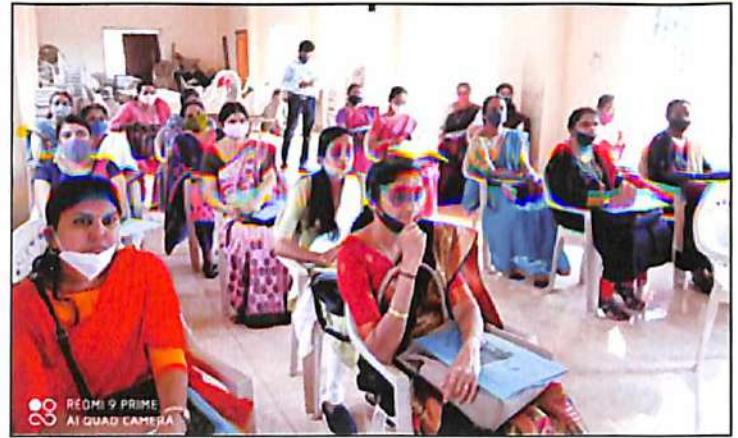
A view of the Gold Appraisal Programme conducted at Koothuparamba Circle Cooperative Union

Cooperative Institutions. Altogether 122 participants participated in these programmes.