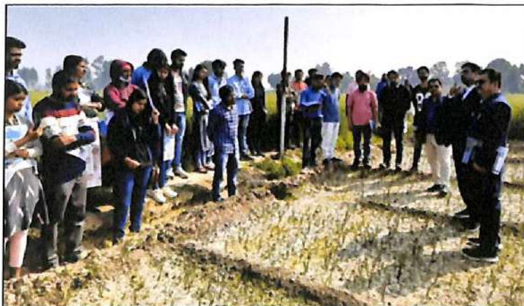
Glimpse of exposure visit of the participants of ACABC Scheme