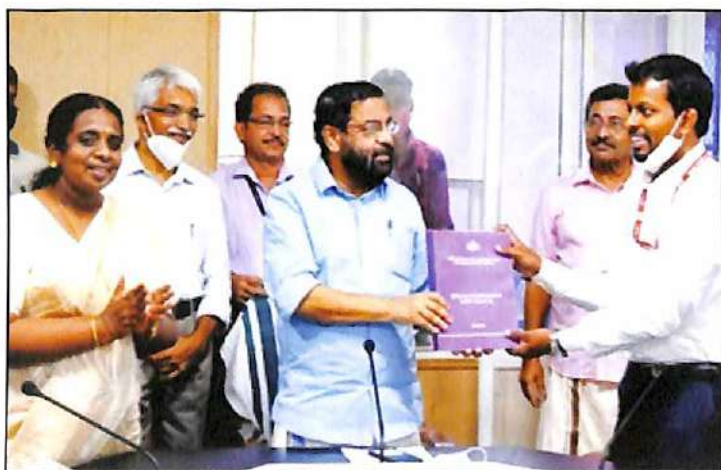
Shri Kadakampally Surendran, Minister for Cooperation releasing the Kerala Cooperative Audit Manual

The uniqueness as well as the magnitude of the cooperative sector in Kerala is reflected in the revised manual. Minister for Cooperation, Shri Kadakampally Surendran, has released the new audit manual and said that the audit of different types of cooperatives will be conducted in accordance with the guidelines of the revised audit manual with effect from 1 st April 2021. Smt. Mini Antony IAS, Secretary Cooperation, presided over the function. Shri Geromic George IAS, Registrar of Cooperative Societies, received the revised manual from the Minister.