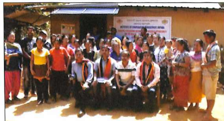
A view of the training Programme on Innovative Business Opportunity for Chakpikarong LAMPS Cooperative Society Ltd., Chandel (Hill District) of Manipur