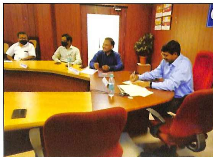
A view of Meeting in which MoU Signed between VAMNICOM, Pune and National Forensic Sciences University (NFSU)