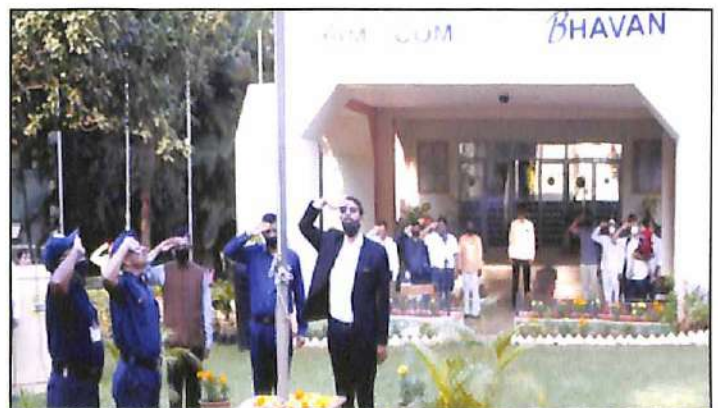
A view of 72nd Republic Day Celebration