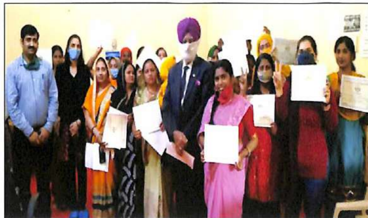
Glimpse of valediction programme for Board Members of Multi Purpose Cooperative Society, Jharsa, Gurgaon