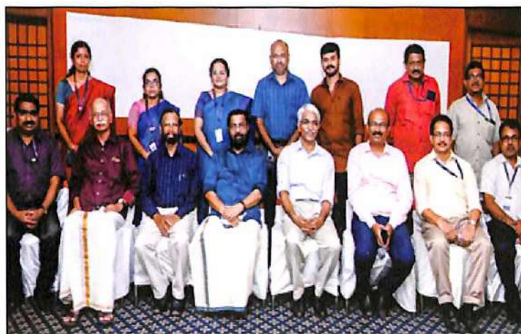
Shri Kadakampally Surendran, Minister along with Kerala Cooperative Audit Manual Revision Team

Readers inputs and suggestions are welcome