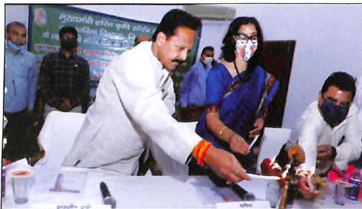
Sh. Subash Singh Hon'ble Cooperative Minister, Govt. of Bihar lighting the inaugural lamp of Agricultural Implements Bank in PACS under Mukhyamantri Harit Krishi Sanyatra Yojana

The Inauguration of Agricultural Implements Bank in PACS under Mukhyamantri Harit Krishi Sanyatra Yojana was held on 31.03.2021. Hon'ble Cooperative Minister, Govt. of Bihar, Sh. Subash Singh inaugurated the programme. In his inaugural address he praised the scheme as it is to benefit the small and marginal farmers of the state in a big way as the farmers in future have not to depend on other sources to get timely support in peak