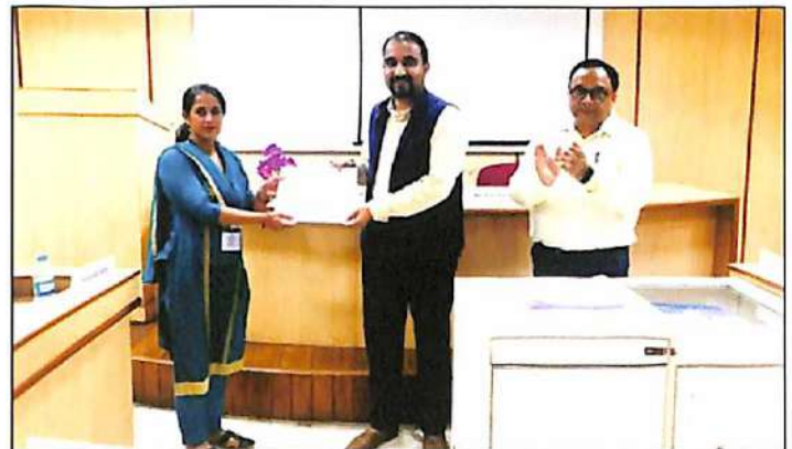
Awarding certificate to a participant