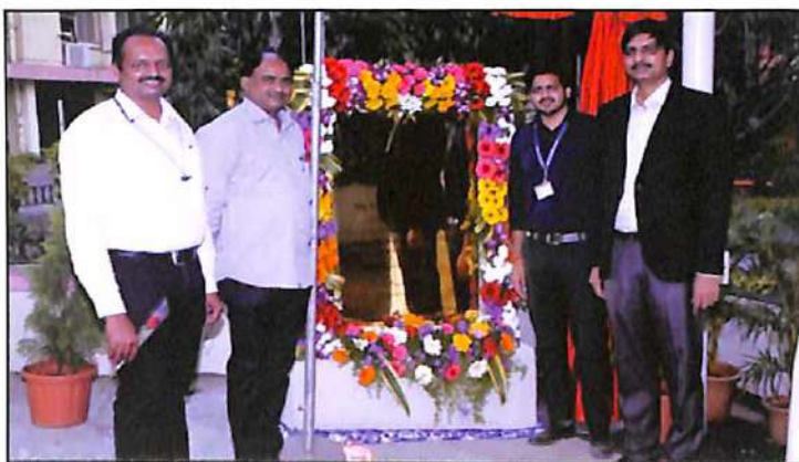
A view of the inaugural ceremony of VAMNICOM CAFE