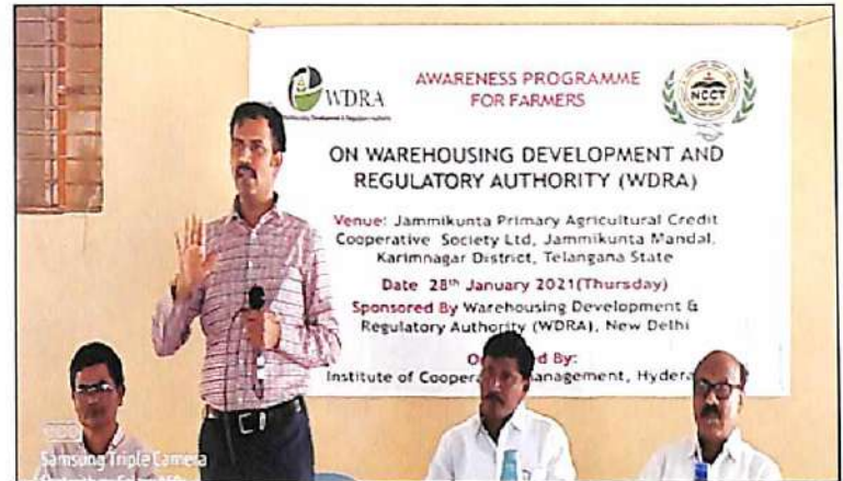
A view of the Awareness Programme on Warehousing Management