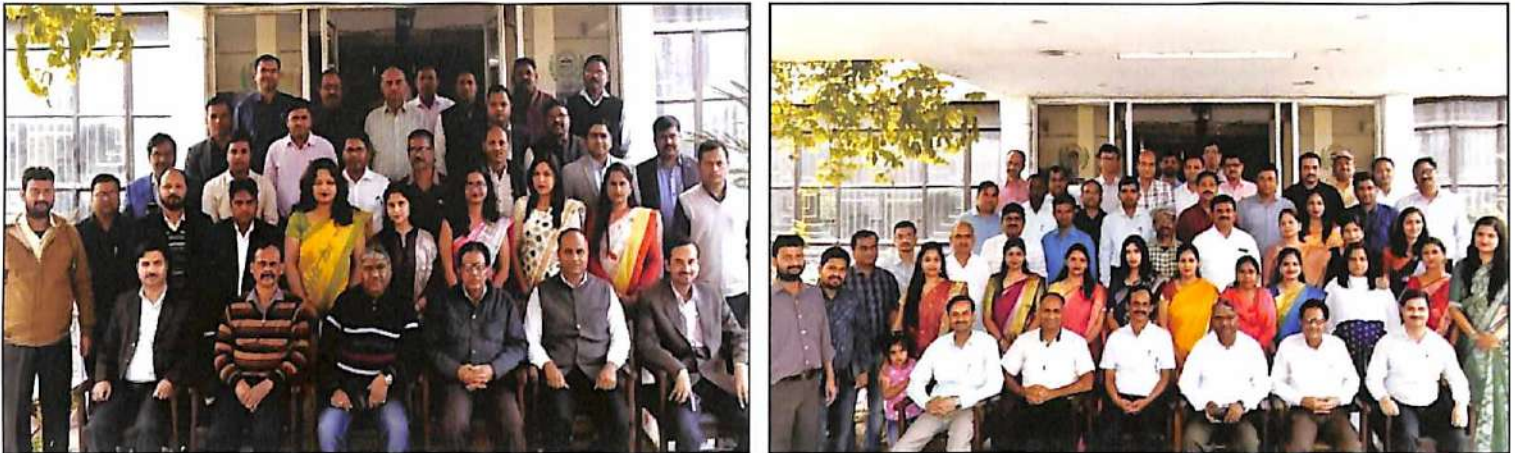
Induction Programme for Assistant Development Officers of Uttar Pradesh State Cooperative Department

the Registrar of Cooperative Societies and supported by faculties of IGICM, Lucknow in their respective areas. Participants were highly motivated & satisfied after the 30 days training programme.