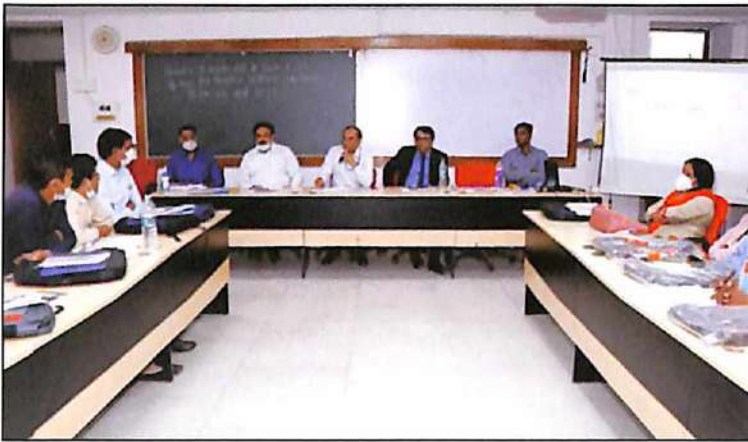
A view of the Training Programme conducted at RICM, Patna from 08.03.2021 to 10.03.2021 for BoDs and CEOs of various FPOs of the State under sponsorship of NABARD's Bihar Regional Office, Patna