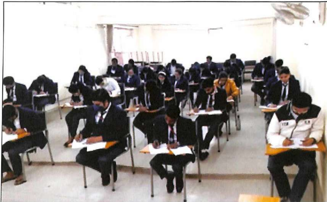
A view of the MBA student performing their sessional examination

ICM, Lucknow is running two years full time MBA Programme which is duly approved by AICTE, New Delhi and affiliated to Dr. APJ Abdul Kalam Technical University, Lucknow with sanctioned intake of 60, out of which 48 students are enrolled in the session 2020-21. The programme offers all important specialization like Marketing, HR, Finance, IT and Operations Management. Most of the students of previous batches are well placed in the industry. The Institute takes keen interest in the academic as well as the personality development of the students to fit them in corporate world.