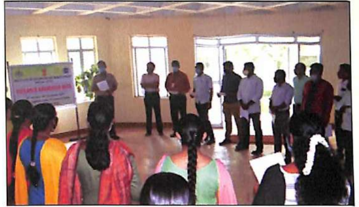
A view of the observation of Vigilance Awareness Week