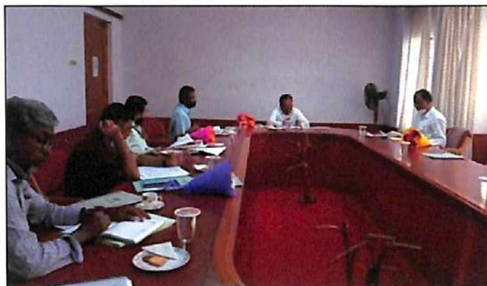
A view of the Management Committee Meeting