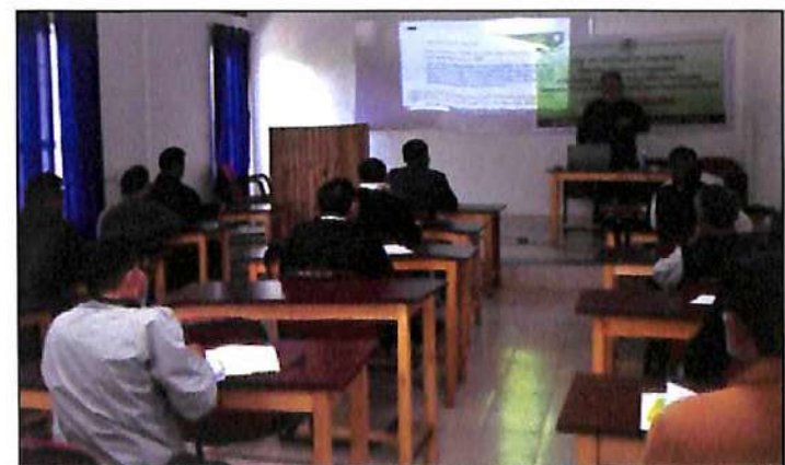
A view of participants during training session

ICM Imphal conducted One Day Outreach Programme on Agri-Reforms Act, 2020 for Chairmen / BODs of PACS / Farming Cooperative Societies of Bishnupur, Chandel, Imphal West and Senapati Districts by following social distancing norms on 25th November 2020. Altogether 16 farmers participated in the Outreach Programme.