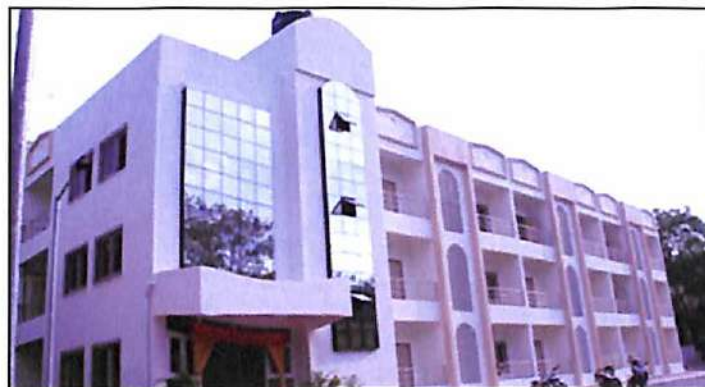
Newly constructed Student's Hostel at VAMNICOM, Pune