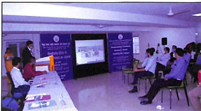
A view of the online inaugural function of Student's hostel at VAMNICOM, Pune by Shri Parshottam Rupala, Hon'ble Minister of State for Agriculture & Farmers Welfare Govt. of India

A newly constructed hostel for PGDM-ABM students of VAMNICOM was inaugurated by Shri Parshottam Rupala, Hon'ble Minister of State for Agriculture & Farmers Welfare, Govt. of India on 20th November, 2020. The newly built hostel is a state-of-the-art three story building which is fully furnished with all modern amenities. It has an accommodation capacity of 100 students. The hostel has been constructed with special attention to facilities for specially-abled people too. Fire safety safeguards have been provided in the Hostel. CPWD with the help of its team of expert construction engineers has made this hostel within the stipulated time frame even when the world is struggling with "COVID 19".