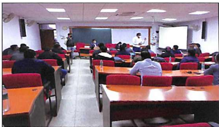
A view of the programme on purchasing of agricultural equipments/implements through Gem Portal

Institute conducted programme on Purchasing of Agricultural Equipments/Implements through GEM Portal under Mukhya Mantri Harit Krishi Sanyantra Yojna for the Cooperative Department Officers on 01.12.2020. Programme aimed at elaboration of various steps in purchasing, bidding through GEM Portal.