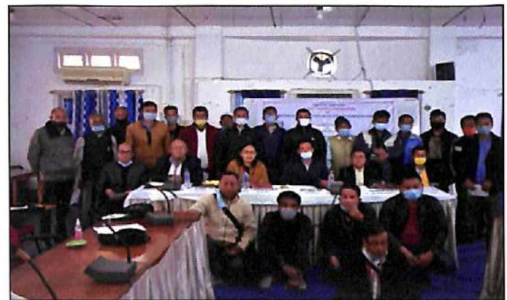
A Group Photo of participants along with Chief Guest & President during the Valedictory Function