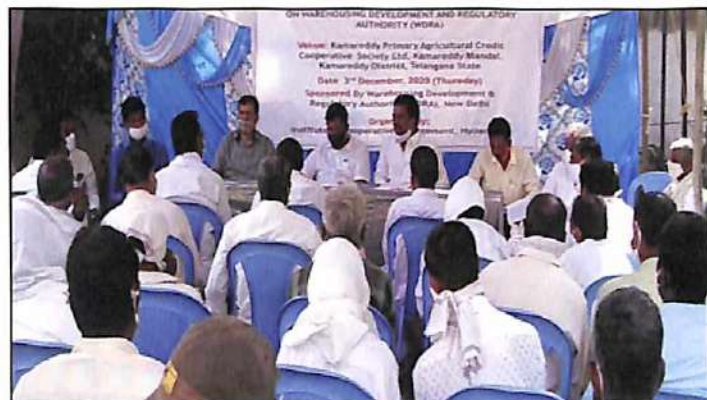
A view of the one day awareness programme for the farmers of Kamareddy PACS, Telangana organised at ICM, Hyderabad in collaboration with WDRA on 3.12.2020