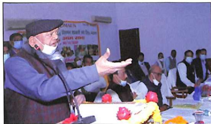
A view of the Dais on AGM of Green Vegetable Processing and Marketing Cooperative Union