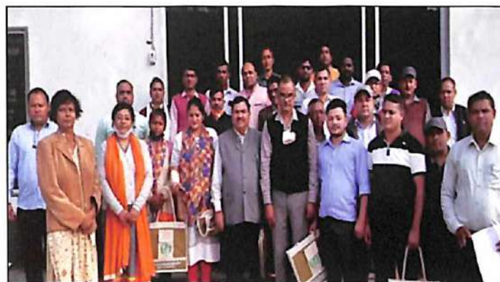
Programme on Developing PACS in to Multi-Purpose Societies for Secretaries of Uttarakhand Primary Agricultural Credit Societies (PACS) from 27.10.2020-29.10.2020