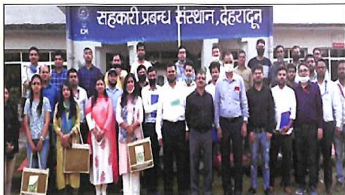
Programme on Financing under Govt. of India Subsidy Scheme for Branch Managers & Officers of Apex & District Cooperative Banks from 19.10.2020 to 21.10.2020