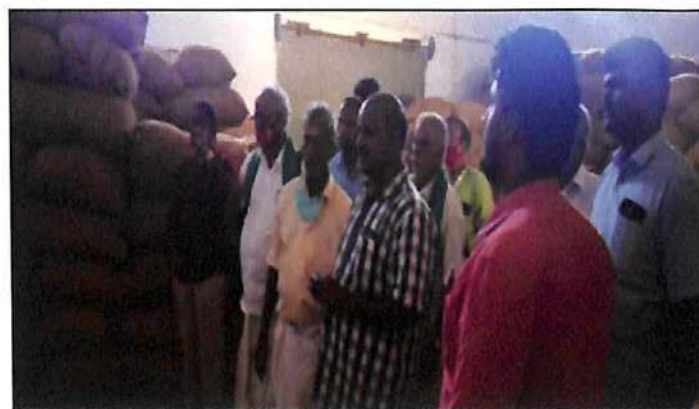
A view of the one day Awareness Programme for Farmers, Traders and Millers organised on 21.10.2020 at Rajapalayam, Virudhunagar District in collaboration with WDRA, New Delhi