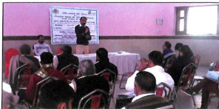
A view of one day Awareness programme for Farmers, Millers and Traders