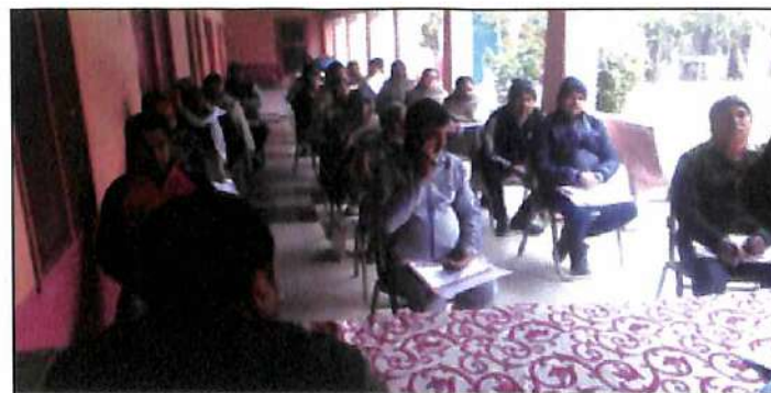
A view of one day Awareness programme for Farmers, Millers and Traders