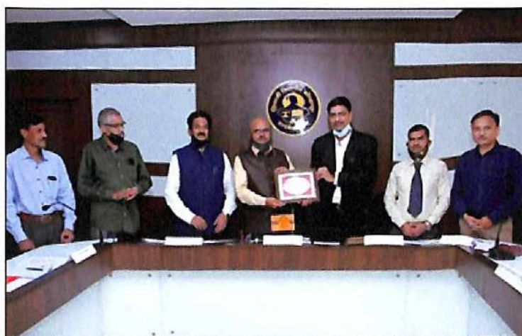
A view of the MoU signing ceremony