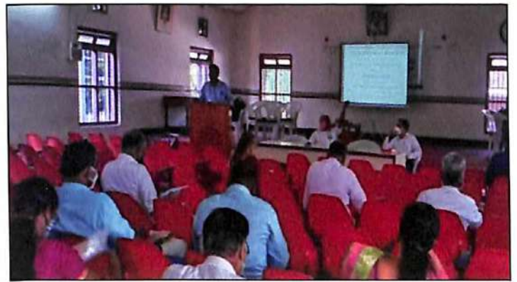
A view of the LDP programme conducted for Board of Director of PACS

Institute Conducted 3 Training programmes under SOFTCOB assistance during December, 2020 namely; LDP for Board of Directors of PACS from 4-6 November, 2020, Developing PACS into Multipurpose Societies for the Secretaries and Board of Directors of PACS from 7-9 November, 2020 and Self sustenance through improved Governance and Management of Resources for the Board of Directors of PACS- from 10-11 November, 2020.