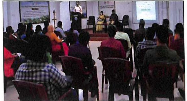
A view of the programme on BDP for the Secretaries and senior staff of PACS under SOFTCOB assistance

ICM, Thiruvananthapuram conducted programme on BDP for the Secretaries and senior staff of PACS under SOFTCOB assistance from 28-30 December 2020 at Kozhikkode