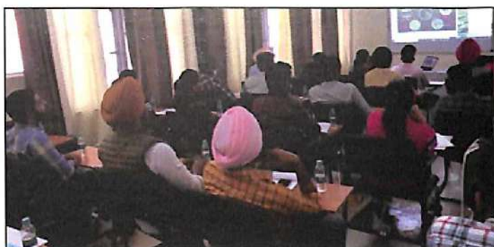
Newly recruited officials of Punjab State Rural Livelihood Mission attending the Orientation-cum-Induction Training Programme