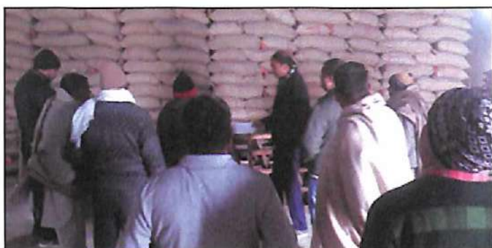
Study visit to Warehouse for the participants of one day awareness programme for Farmers, Miller & Traders