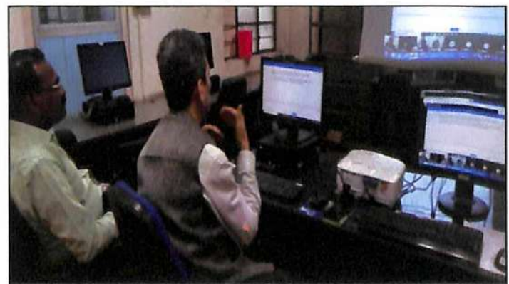
A view of the Webinar on Agri Reforms Act, 2020