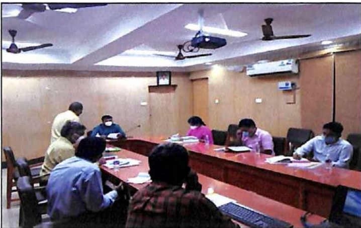
A view of the DLCC Meeting with District Collector, Cuddalore