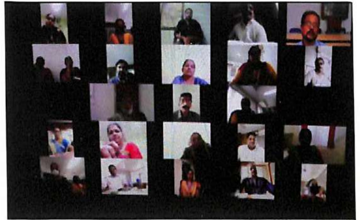
Online Management Development Programme for the Officers of Kerala Bank