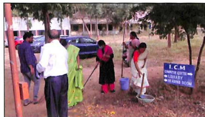
A view of the Swachhta Pakhwada conducted at ICM, Hyderabad