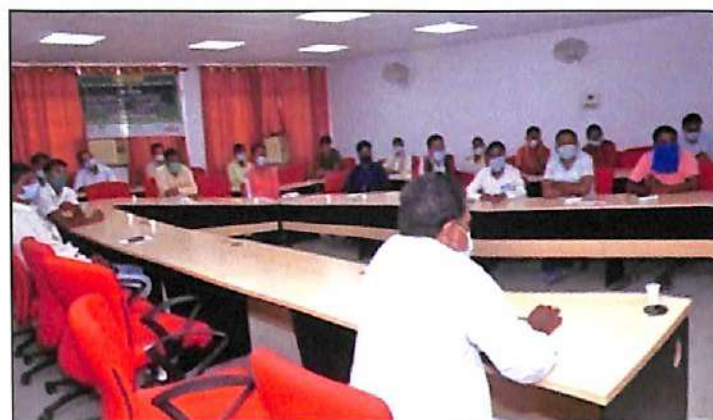
A view of the Capacity Development programme for the Board of Directors of FPOs

The Institute organised Capacity Development programme for the Board of Directors of FPOs from 13.10.2020 to 15.10.2020. The programme deliberated on specific and shared responsibilities of BOD, Statutory compliances, current market practices, strategies to mitigate market risks, networking skills and stakeholders engagement etc.