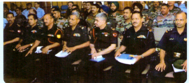
A view of the participants participated in three months Certificate Course on Cooperative Banking for Senior Defence Officers & Sales Management for the Defence Personnel in collaboration with Directorate General of Resettlement from 4.12.2017 to 23.2.2018 organised by RICM, Chandigarh

Readers inputs and suggestions are welcome