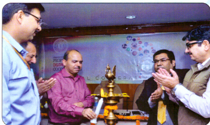
Inaugural Ceremony of 64th All India Cooperative Week