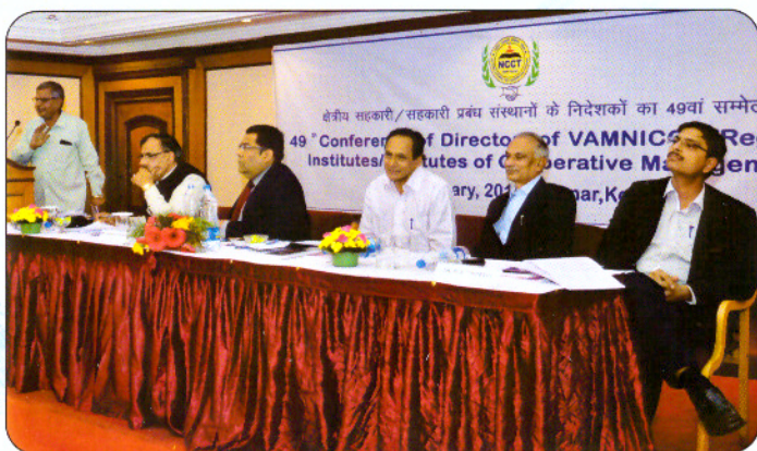
A view of the 49th Conference of Directors of RICMs/ICMs