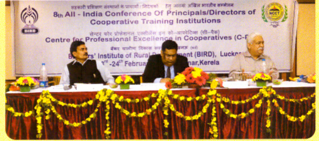
A view of the 8th All India Conference on Principals & Directors of Cooperative Training Institutions (CTIs)