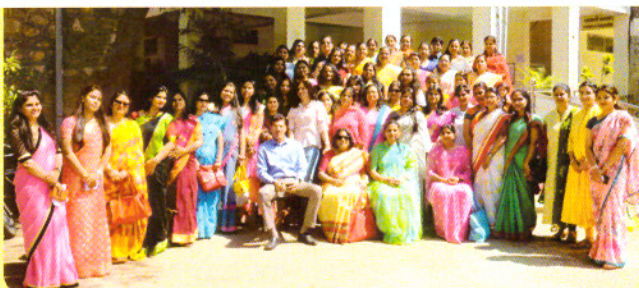
A group photo of Lady Officers, Inspectors & staff of Cooperative Department organised by ICM, Jaipur to mark the celebration of International Women's Day on 8th March, 2018