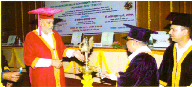
Shri Parshottam Rupala, Hon'ble Union Minister of State for Agriculture & Farmers Welfare, Govt. of India lighting the Inaugural Lamp of the Annual Convocation - PGDM-ABM 2015-17