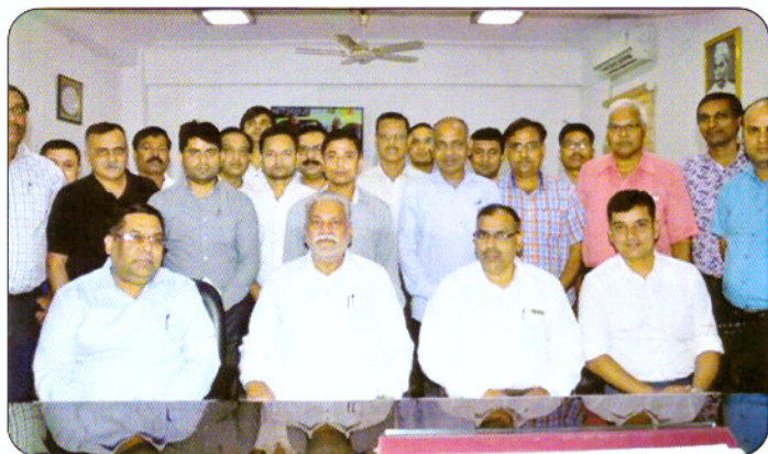
A group photo of participants of workshop with Shri Parshottam Rupala Hon'ble Union Minister of State for Agriculture and Farmers Welfare, Government of India

distributed the Certificates to the participants of the Workshop. The participants had a meeting with Hon'ble Union Minister of State for Agriculture and Farmers Welfare Shri Parshottam Rupala during the Valedictory Function.