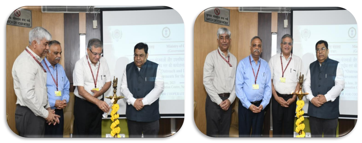
Inauguration of the Workshop by Lighting of Lamp by the Chief Guest and Guests of Honour